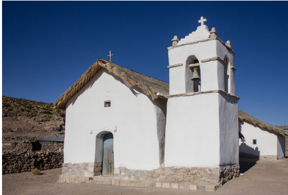
Virgen del Carmen Church

Tacora is a village located at an altitude of 4,090 metres in the region of General Lagos, in northern Chile. Founded as the main centre of an Inca community, its history is closely linked to sulphur extraction, which began towards the end of the 19th century, and was later facilitated by a railway connection with La Paz and Arica. Already in decline after the Second World War, in 1967 the extraction ceased completely and the population began to migrate and settle on the coast.