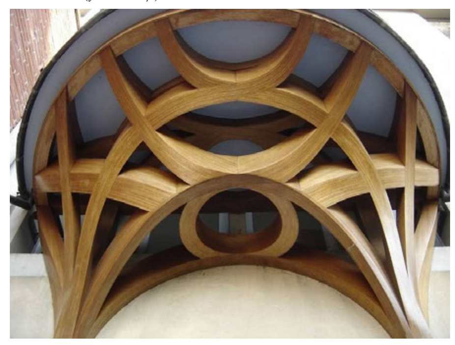
Masterpiece of carpentry at the Compagnons du devoir guild house in Toulouse (Jonathan Lahaye)

For eight centuries l'art du trait has been used in France to determine and express the values of structural details through precise working drawings. With this method a carpenter or stone carver can determine all the dimensions and angles required, prior to layout or assembly of components. This was originally done with full-size working drawings, often drawn on the floor. With the evolution of technology the method was developed to include the use of scaled-down drawings.