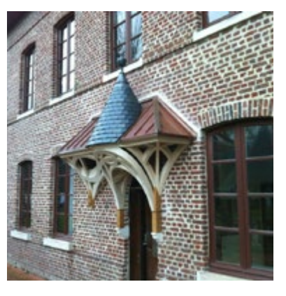
A complex guitarde above the entrance to the Compagnons du devoir guild house in Mont-Saint-Aignan near Rouen (Hans-Peter Koennecke)