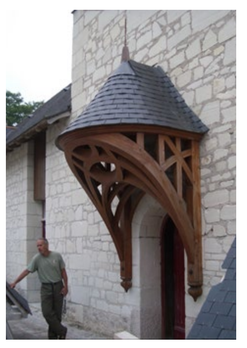
Masterpiece of carpentry at the Compagnons du devoir guild house in Saumur