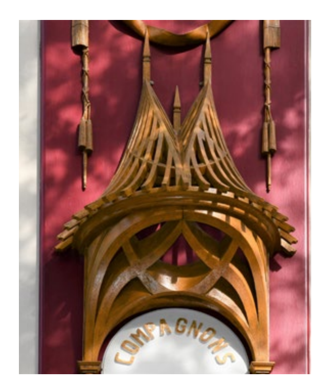
The façade of the Aux Arts et Sciences réunis restaurant at 161 avenue Jean Jaurès in Paris features a small guitarde canopy with a double-curved surface that has been sectioned on an angle to create two double-curved hips and a straight valley in the center